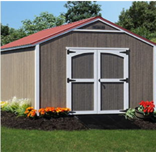
Shed or Barn

Doing a summer project? Did you get your building or zoning permit? Many common projects, like remodels, re-roofs, sheds, barns, decks, fences and pools require a permit and inspections. Contact the Building Department at 269.978.0715 or visit www.texastownship.org/building for more information.