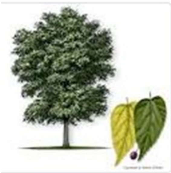
Common Hackberry Tree