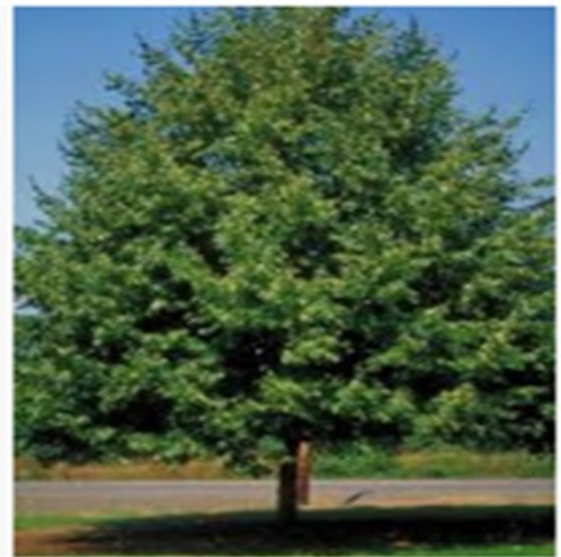
Greenspire Littleleaf Linden Tree