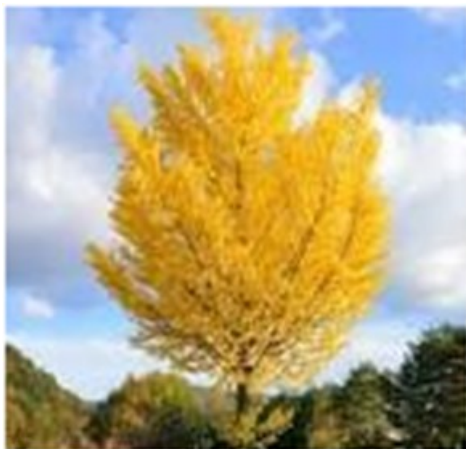
Autumn Gold Ginko