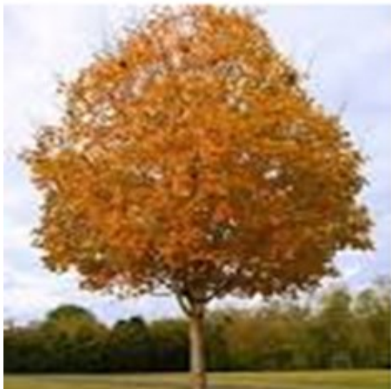
Green Mountain Sugar Maple