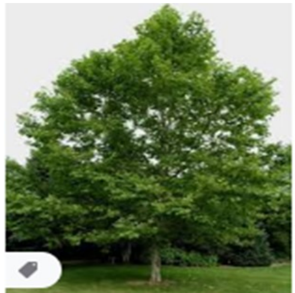
Blood gold London Planetree