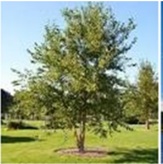
River Tree Birch