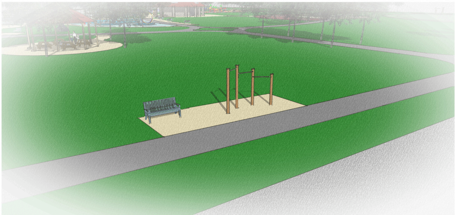
TYPICAL EXERCISE STATION